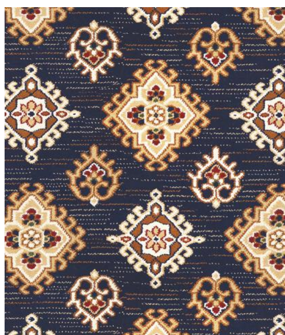
0089 - TIMELESS BLUE Design Repeat - 49.5 cm x 50 cm