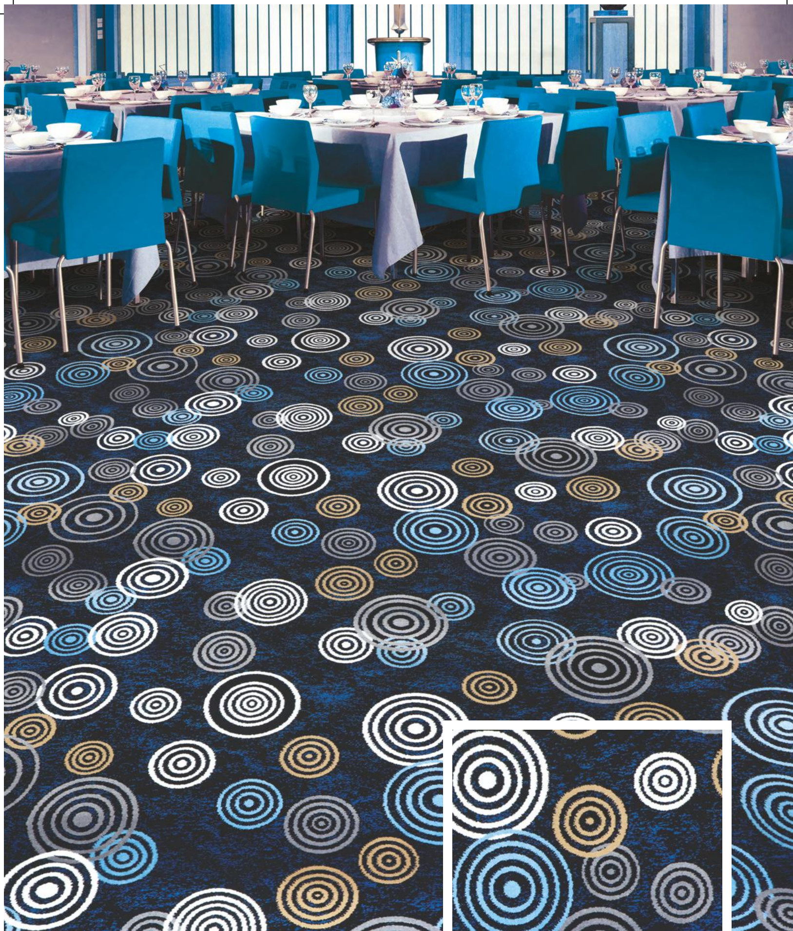
1332 - COLOSSAL BLUE Design Repeat - 198 cm x 100 cm