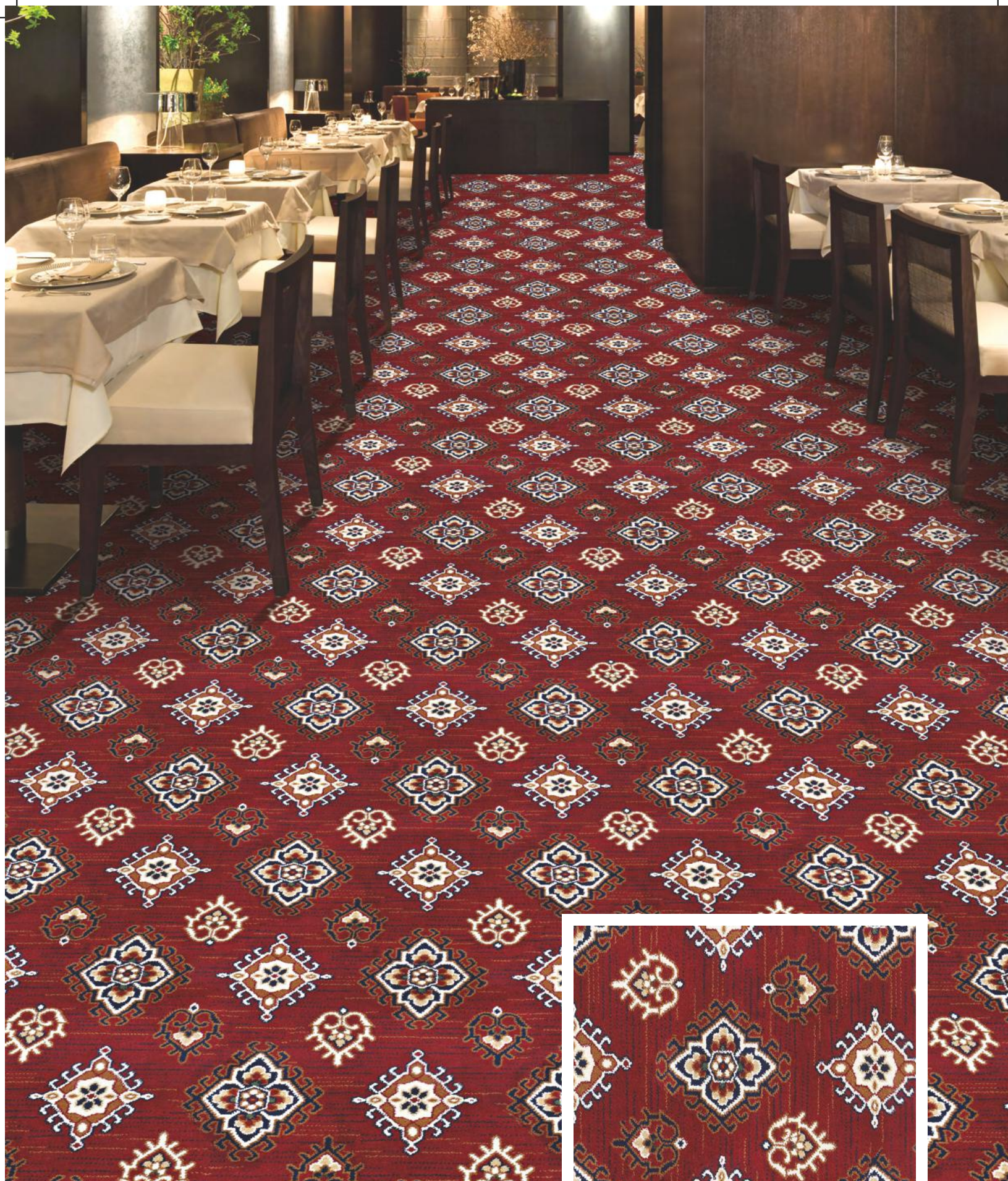
0089 - TIMELESS RED Design Repeat - 49.5 cm x 50 cm