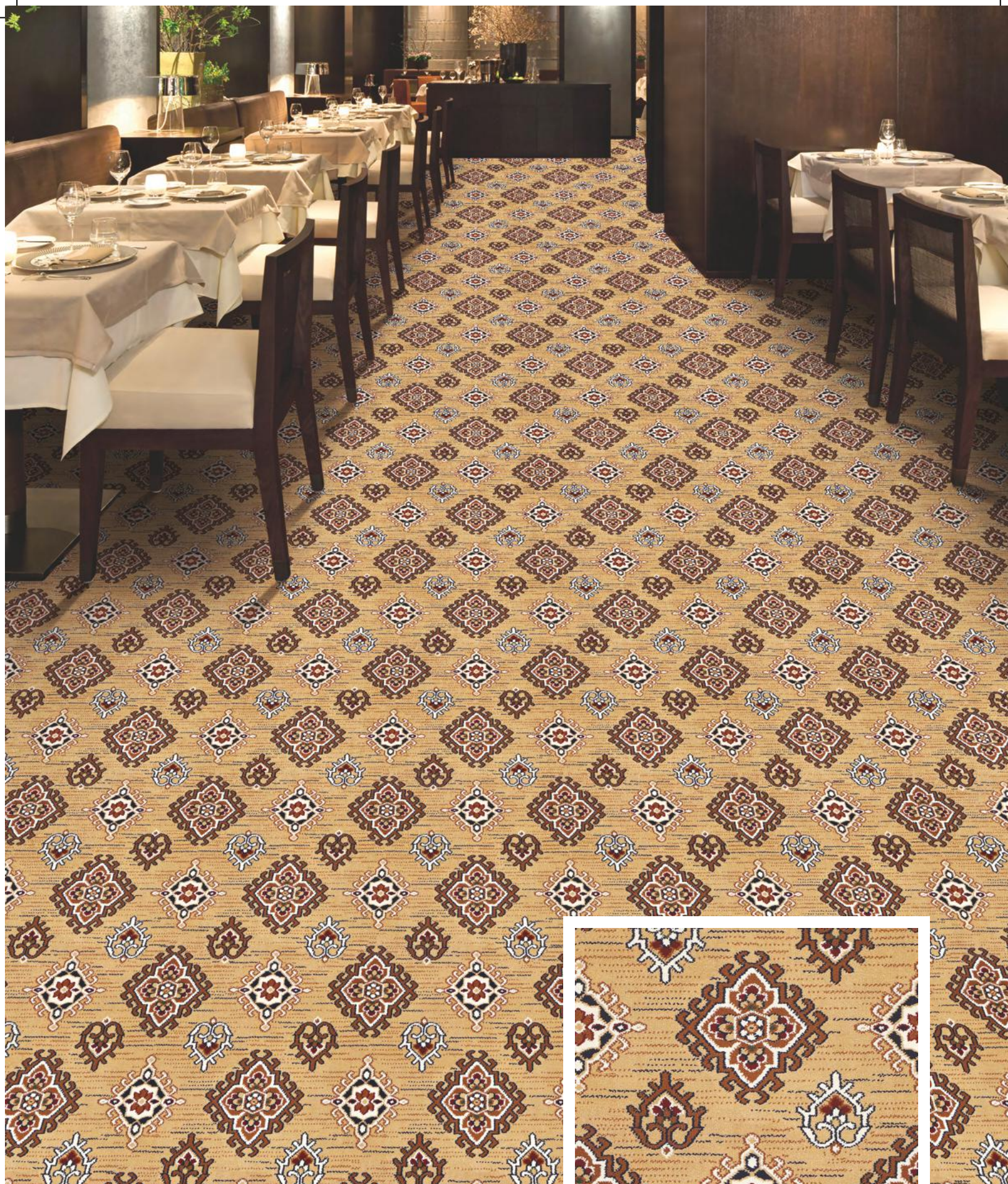
0089 - TIMELESS BEIGE Design Repeat - 49.5 cm x 50 cm