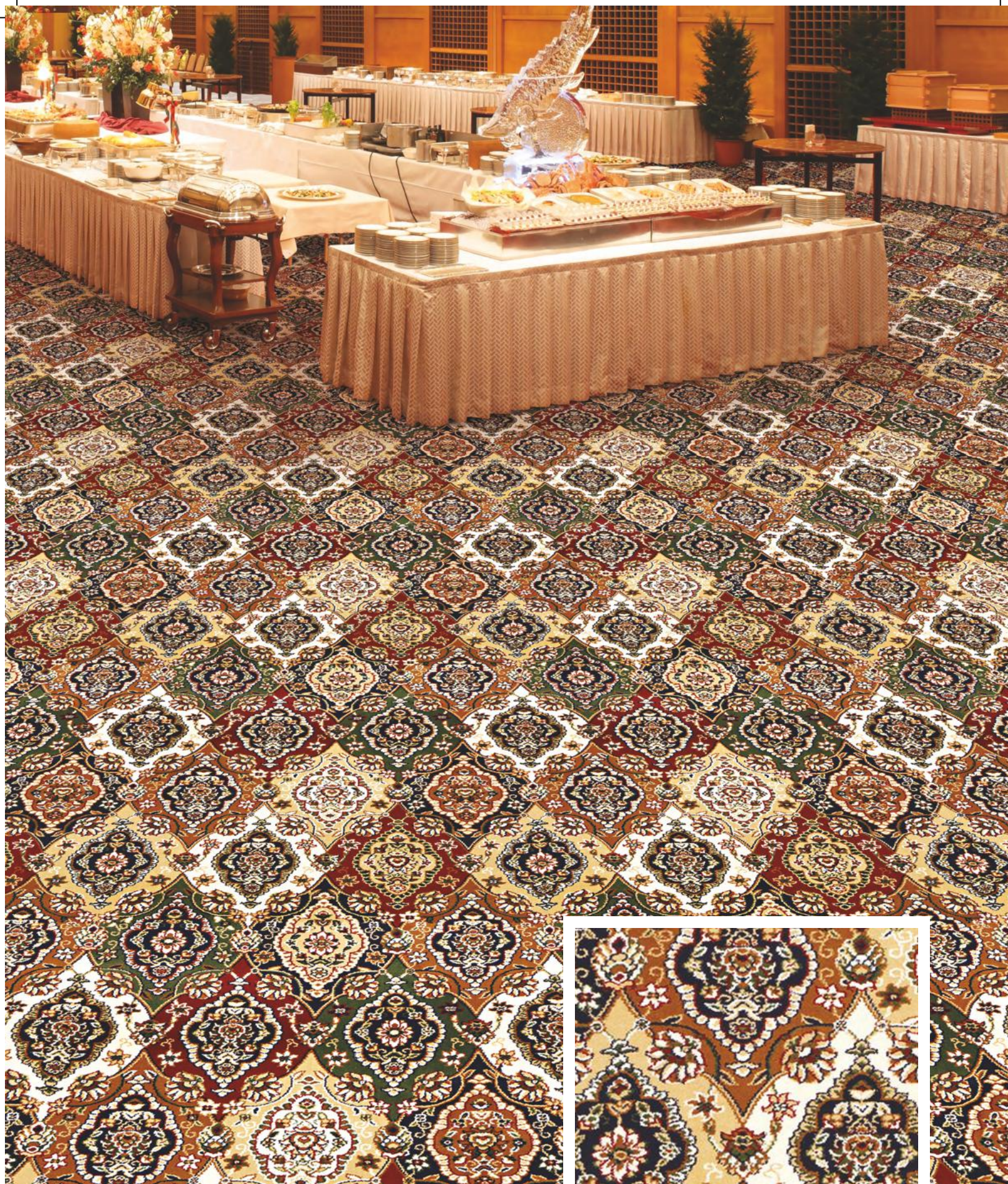
1331 - MYRIAD BLUE Design Repeat - 99 cm x 100 cm