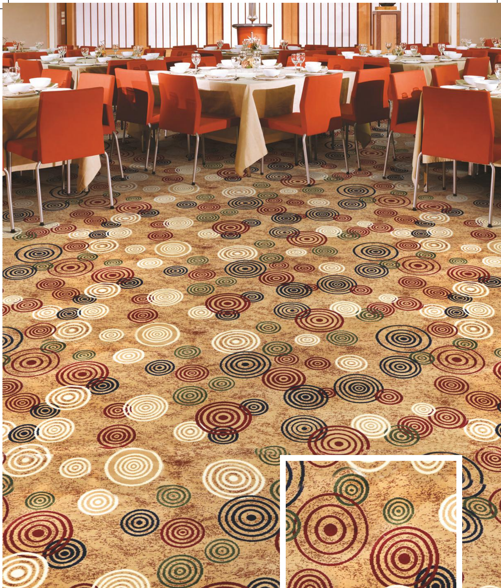
1332 - COLOSSAL BEIGE Design Repeat - 198 cm x 100 cm