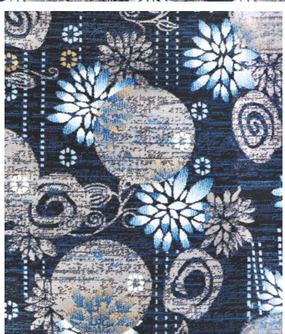
1325 - TROPICAL BLUE Design Repeat - 99 cm x 100 cm