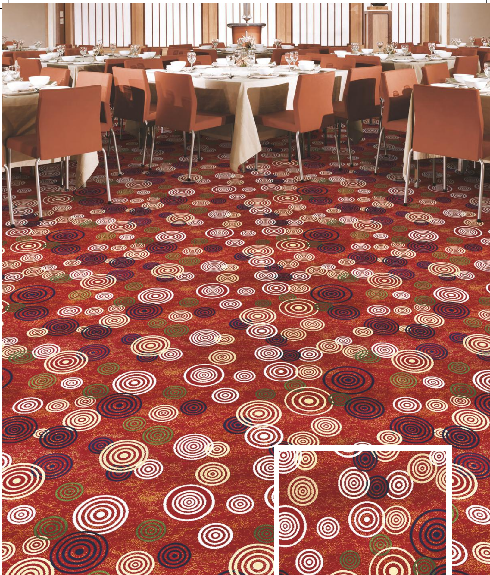
1332 - COLOSSAL RED Design Repeat - 198 cm x 100 cm