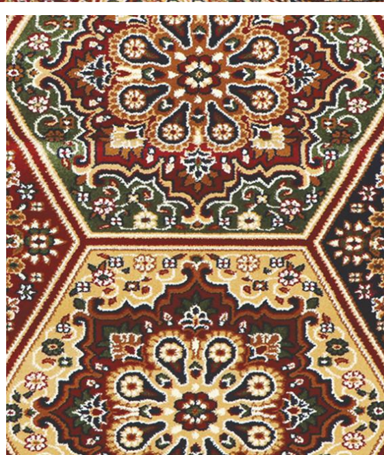
1328 - MANDALA RED Design Repeat - 198 cm x 100 cm