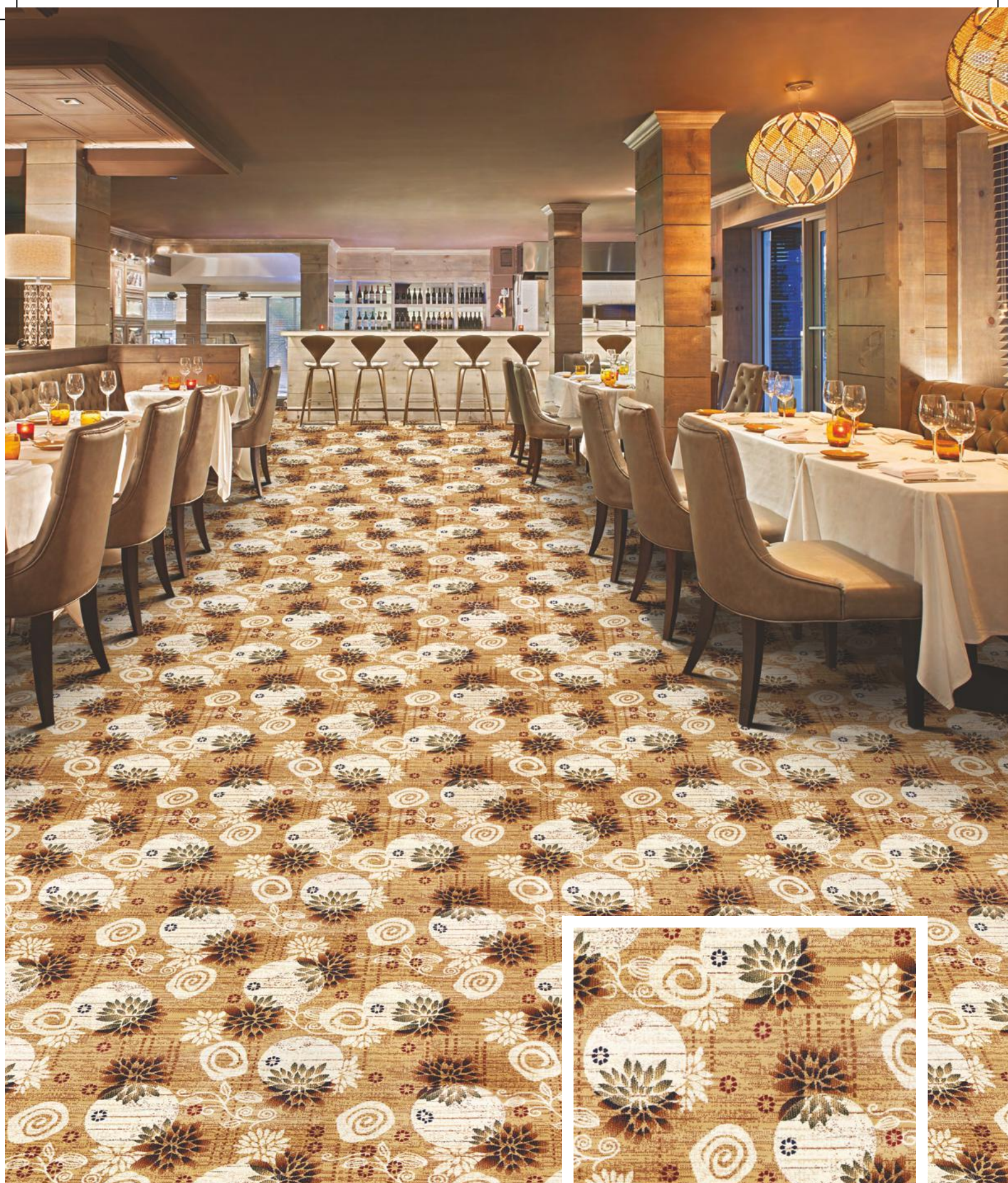
1325 - TROPICAL BEIGE Design Repeat - 99 cm x 100 cm