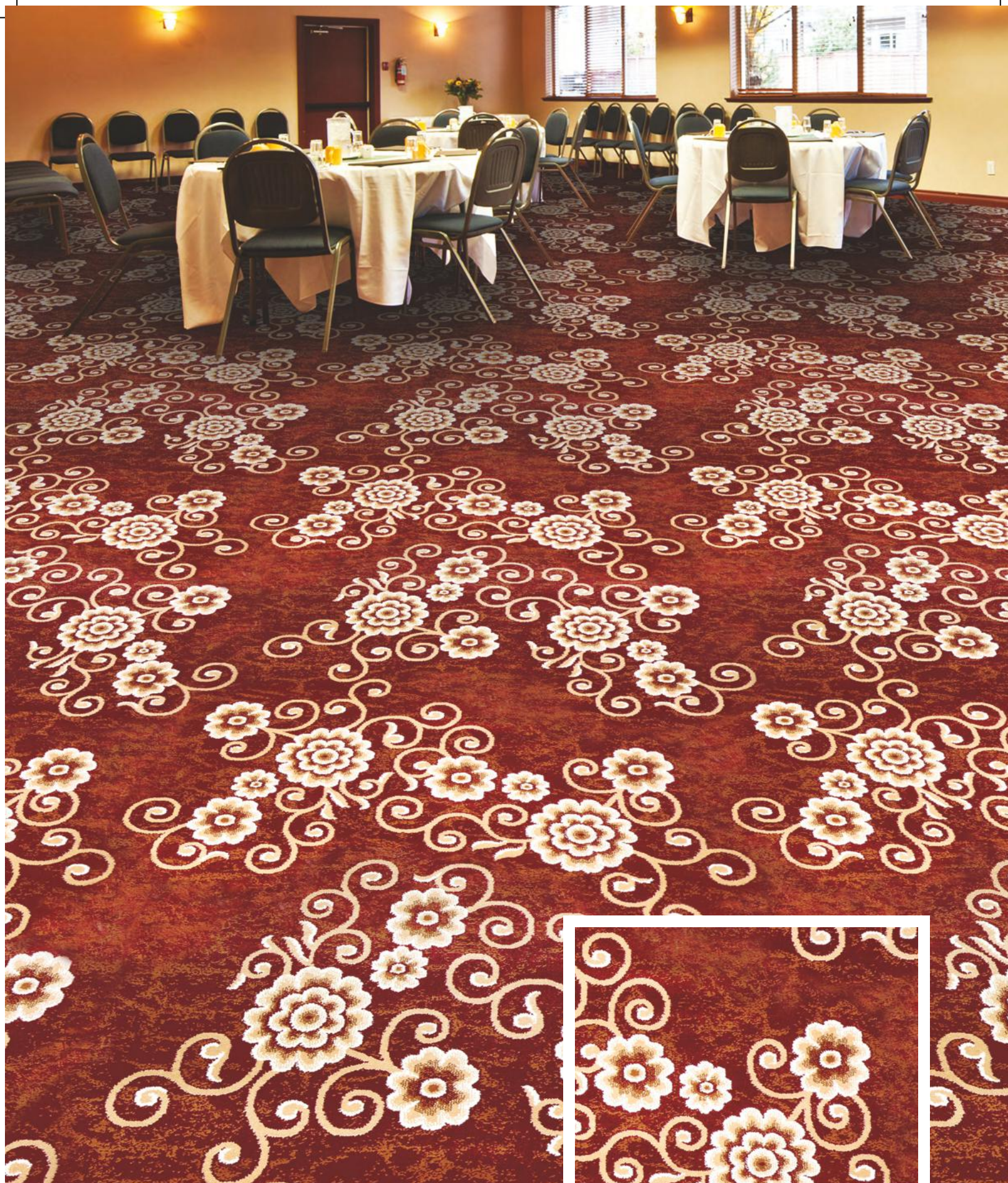
1334 - FLORAL RED Design Repeat - 99 cm x 100 cm