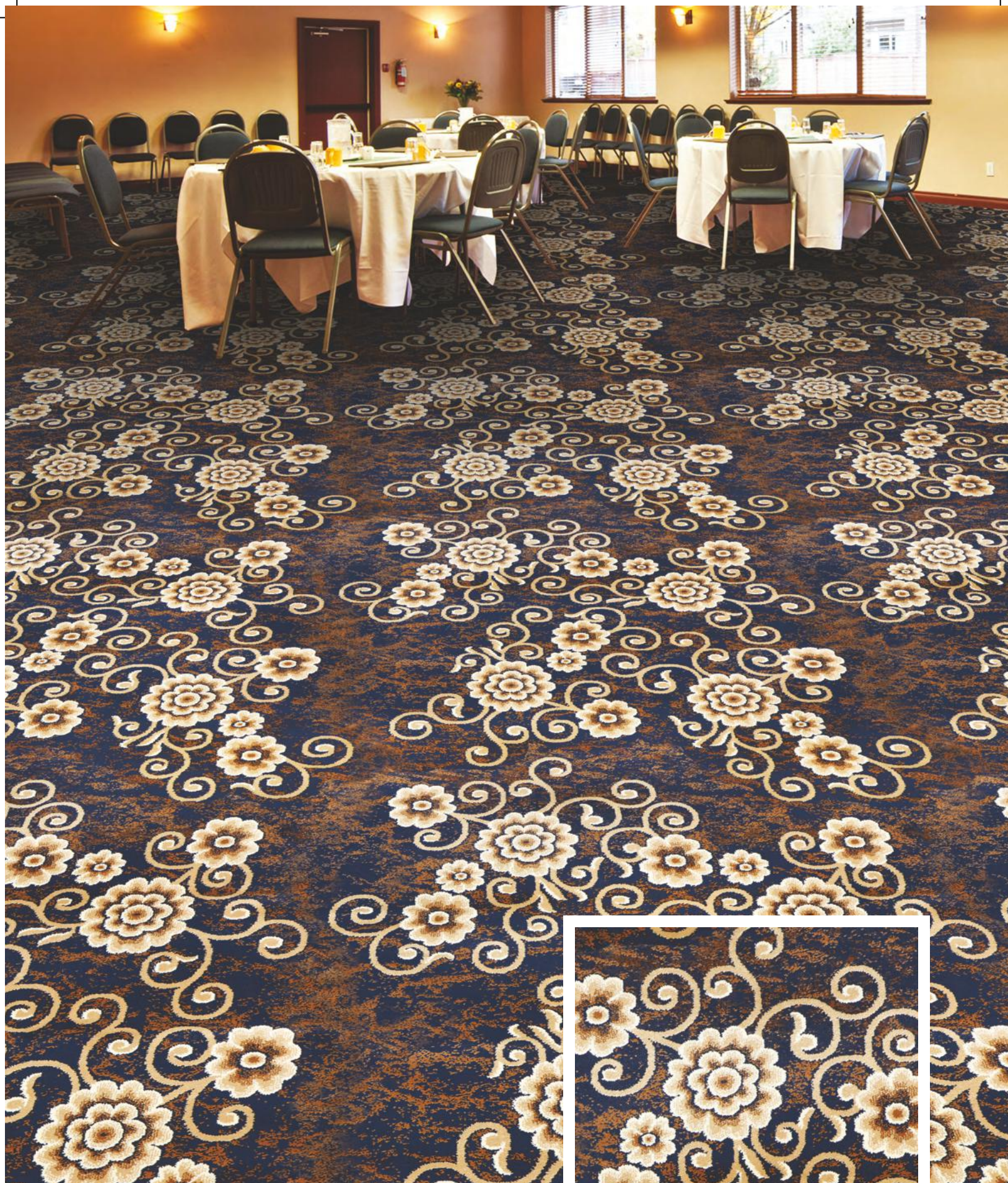
1334 - FLORAL BLUE Design Repeat - 99 cm x 100 cm