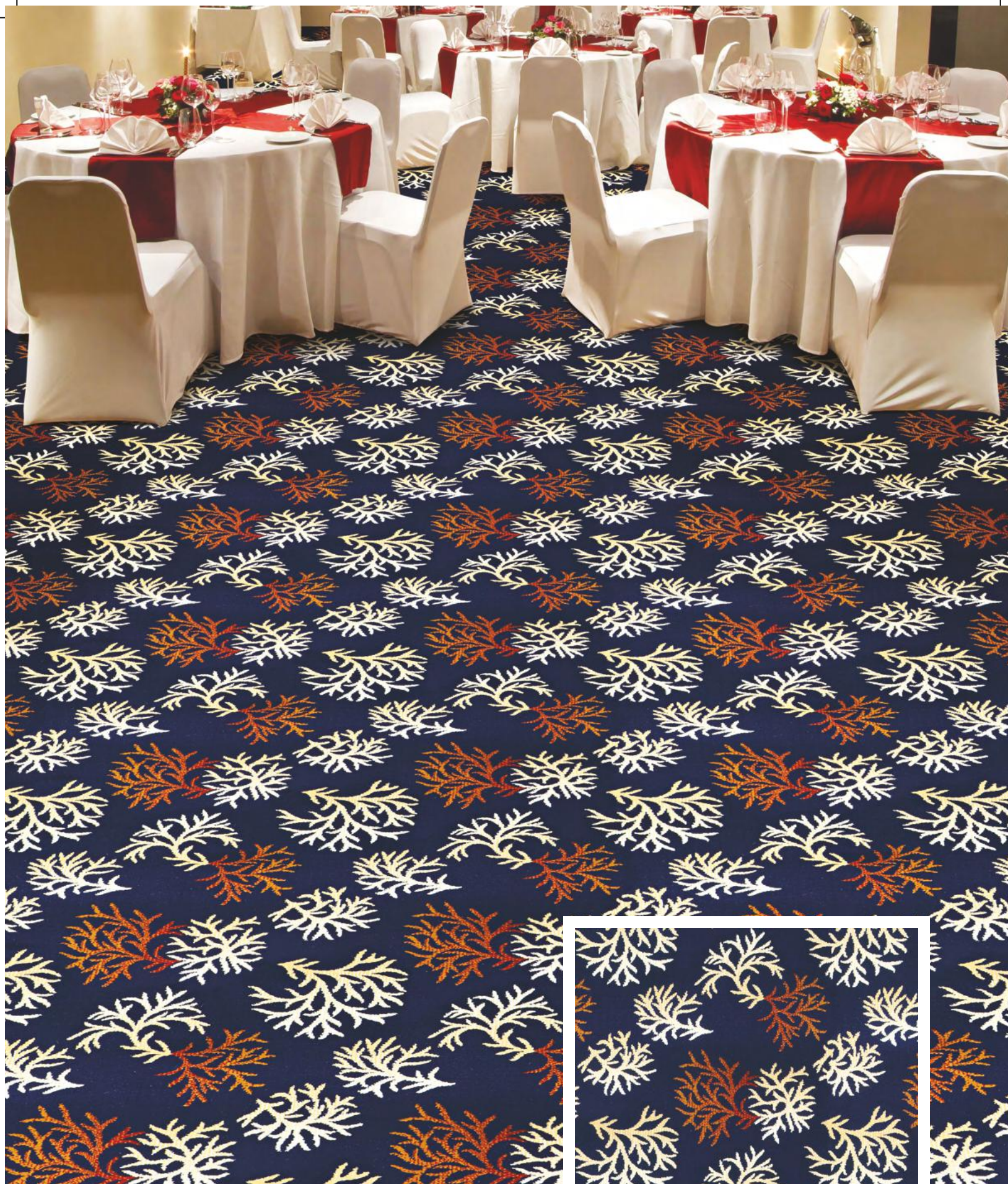
1327 - FOREST BLUE Design Repeat - 56.56 cm x 50 cm