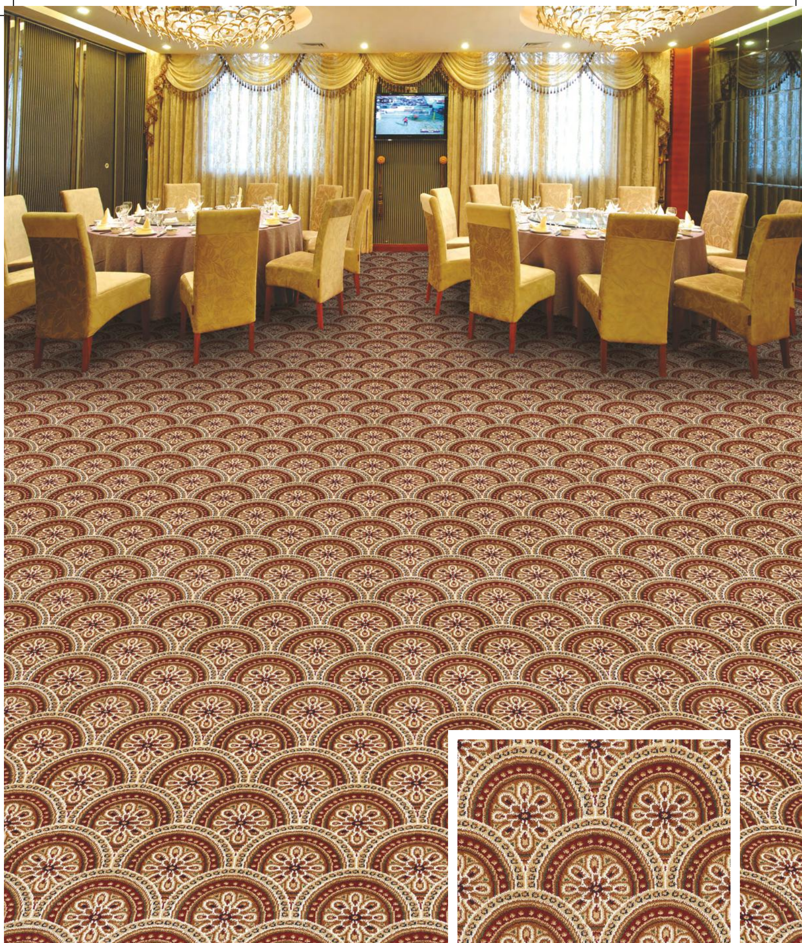
5818 - ORIENTAL BEIGE Design Repeat - 25 cm x 25 cm