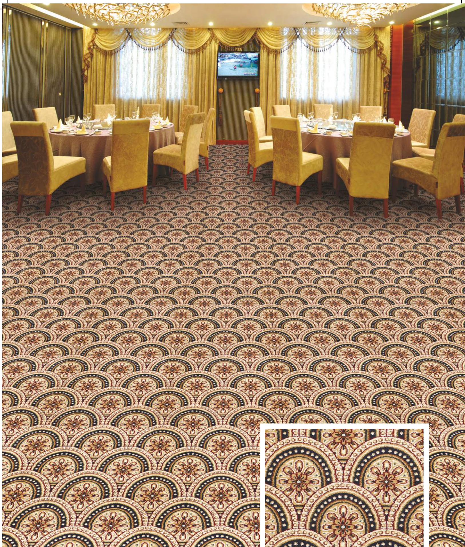
5818 - ORIENTAL IVORY Design Repeat - 25 cm x 25 cm