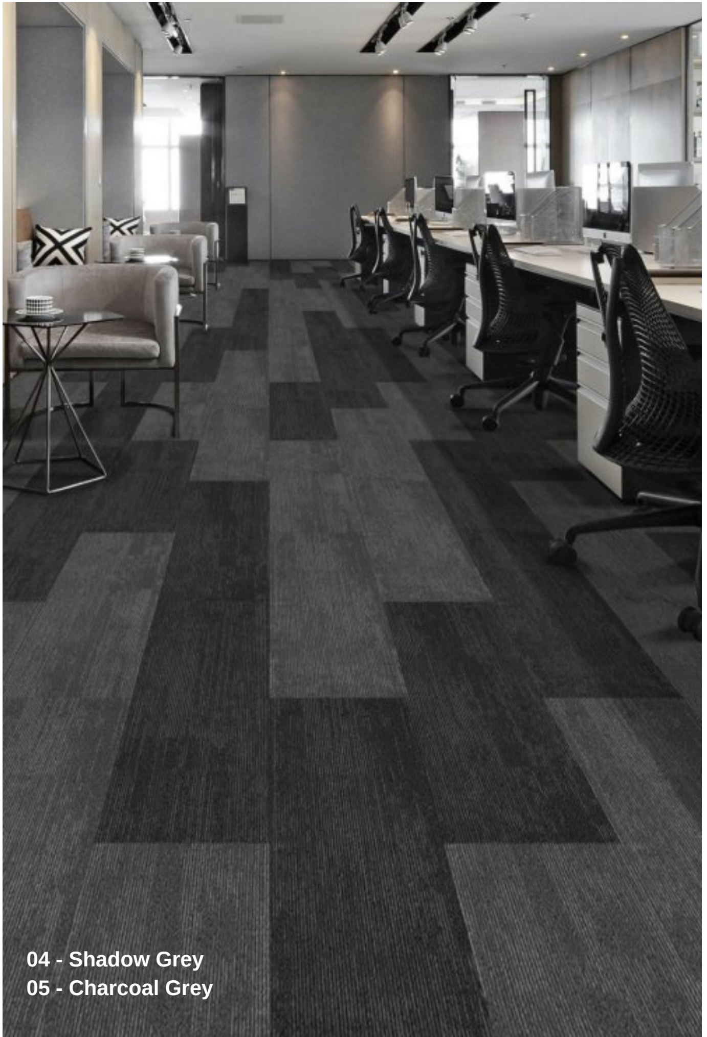
04 - Shadow Grey 05 - Charcoal Grey